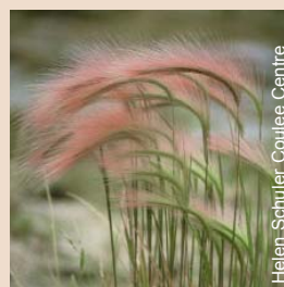
Helen Schuller-Coulee Centre