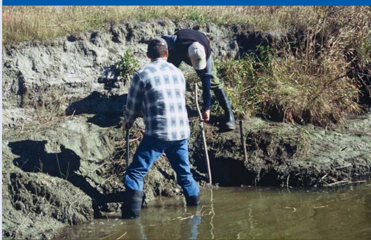
The initial row of live poles for wattle fences are placed near the water's edge. These poles are usually larger in diameter than the poles placed horizontally behind this row. Poles should be at least 80% underground as being demonstrated here.

The waterjet stinger was specially designed to use high-pressure water to hydrodrill a hole in the ground to plant cuttings.