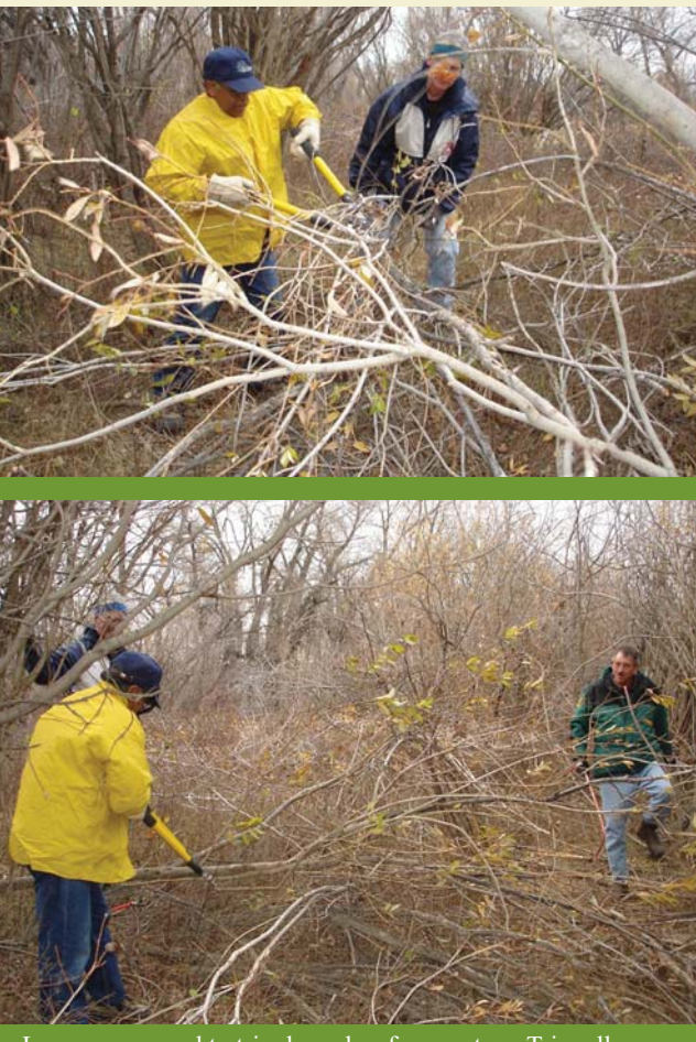
Loppers are used to trim branches from a stem. Trim all branches that are smaller than 2 cm.

Cuttings should be trimmed so that the smallest part of the cutting is a minimum of 2 cm in diameter or about the size of your thumb ('rule of thumb'), and at least 50 cm to 3 m long, depending on which soil bioengineering treatment is being used. Ensure cuttings are healthy and growing well; that is, they should be green and soft if the bark is scraped away. Avoid dying or diseased wood.