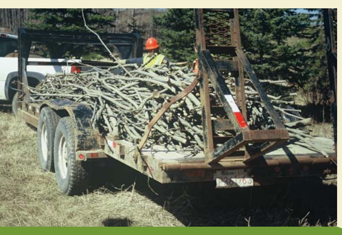
A lot of live but dormant plant material is needed to construct a bioengineering project. A way to easily transport that amount of material is needed.

For the most effective use of plant cuttings, use what you harvest within a few weeks. If plants need to be stored for longer, remember to handle and treat the material like living plants. Cuttings need to be kept moist and protected from hot sun, drying winds and drying frosts. To extend the viability of cuttings, store them in a dark area to slow metabolism. Wrap cuttings with wet burlap and soak with water every day or two. Cuttings may be stored in a cold storage facility (about 0°C) or snow banks, as long as they are kept moist.