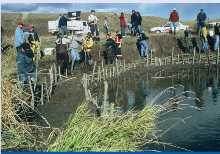
Wattle fence construction on West Nose Creek. The tools and techniques of bioengineering are quite simple, but the process can be labour intensive.