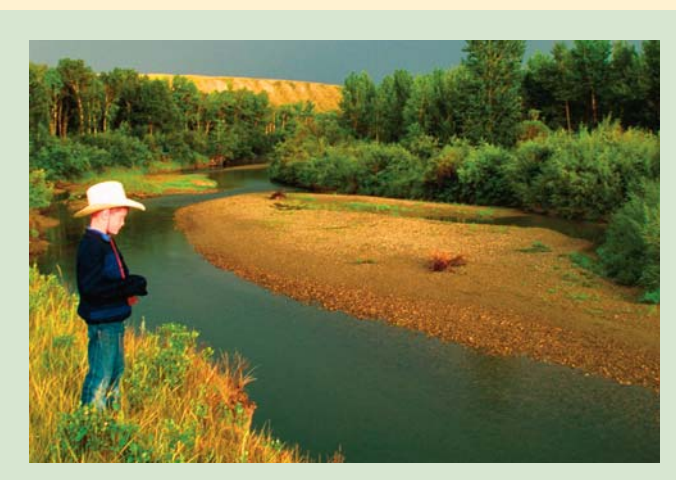
Healthy riparian areas sustain us. We invite you to work with Cows and Fish to conserve, restore and maintain these vital green zones.

Cows and Fish is a partnership of groups and agencies that have come together to foster a better understanding of how improvements in management of riparian areas can enhance landscape health and productivity, for the benefit of landowners and others who use and value these green zones.