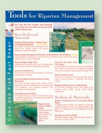
Tools for Riparian Management: A complete list of available resource materials.