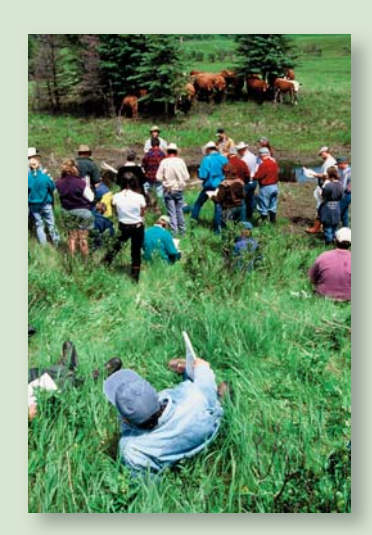
Talk to us about a presentation or workshop in your community.

Community and Producer stories: Examples of good stewardship.