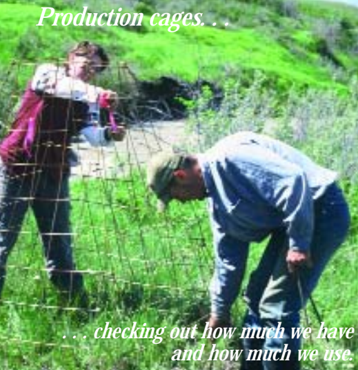
Production cages . . .