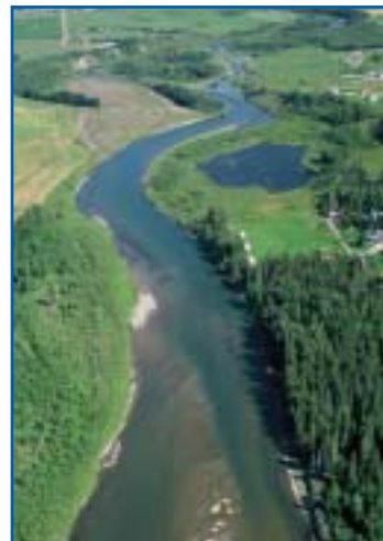
The Red Deer River is in the "Large River" category