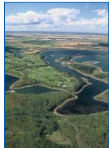
Lower Therien Lake and the wetland complex next to it are examples of the "Lakes and Wetlands" category